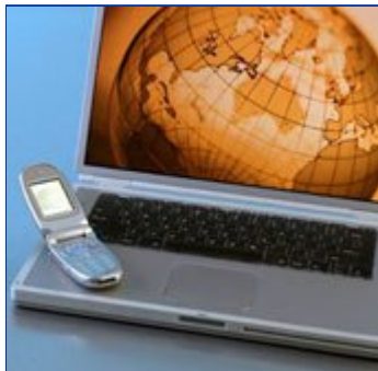
In Pictures: How To Stalk Your Family

They say you can never really escape your family. And new technology may make that aphorism a reality: Getting away from friends and loved ones may soon be impossible due to gadgets that track your every move.